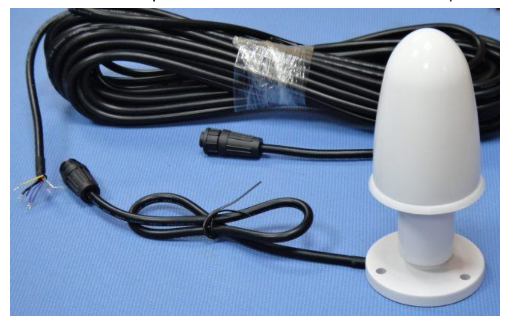
Garmin compatible Marine GPS Receiver

MTK MT3339 Chip GPS Marine Receiver with Full Waterproof