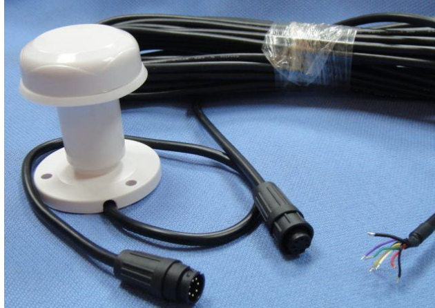
Garmin compatible Marine GPS Receiver

MTK MT3339 Chip GPS Marine Receiver with Full Waterproof